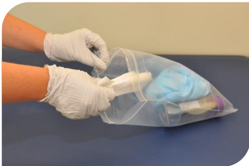
Image: Placing the used wipes and paper towel in the waste bag