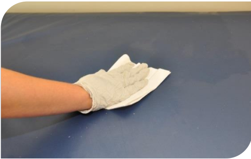
Image: wiping leftover liquid