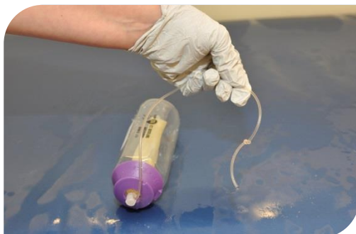
Image: pinching the tube to prevent more spillage from occurring