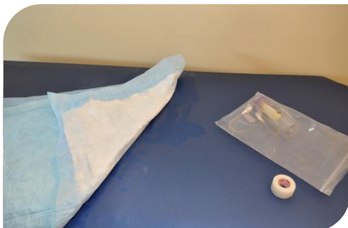
Image: placing the blue pad on the wet area