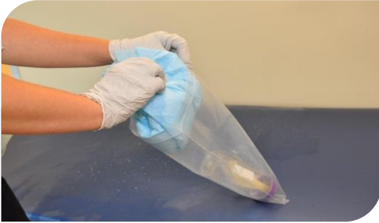
Image: placing pad in the waste bag