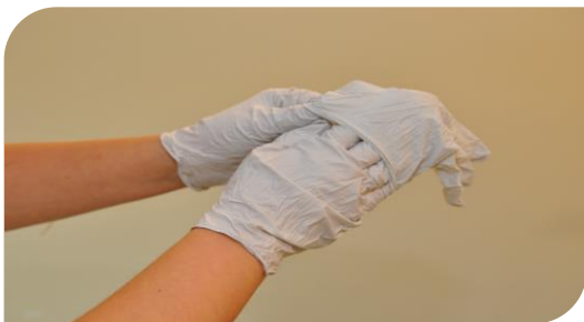
Image: putting on both pairs of gloves