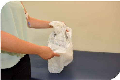
Image: placing waste bag into a plastic bag, then placing it again into a second plastic bag

19. Put your Ziploc waste bag in a plastic bag and put that in a second plastic bag.