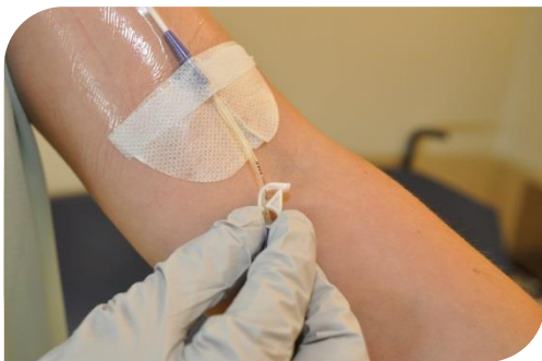
Image: clamping the catheter shut