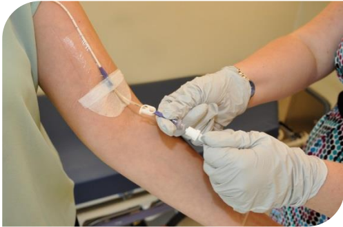
Image: unscrewing catheter from the tubing