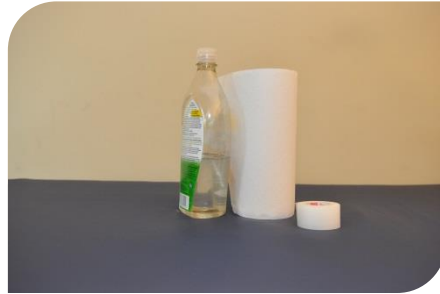
Image: items you need from home