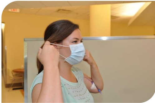
Image: Putting mask on