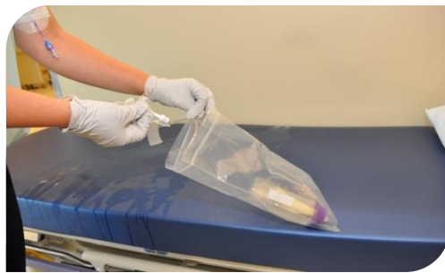
Image: placing infusion bottle into waste bag