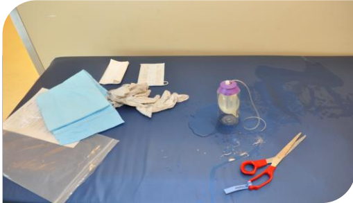
Image: taking out spill kit items