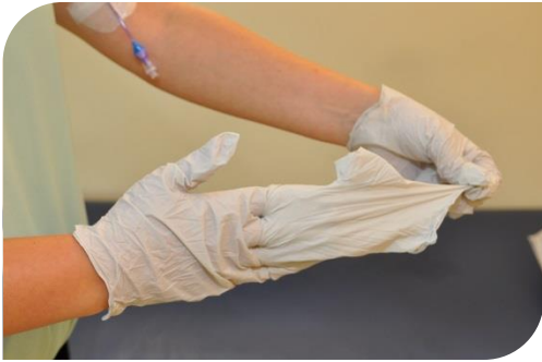
Image: removing the top pair of gloves and then putting them in waste