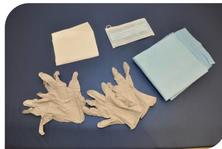
Image: contents of your spill kit