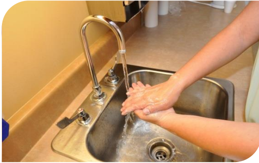
Image: washing hands with soap and hot water

18. Seal the bag and wash your hands with soap and hot water.