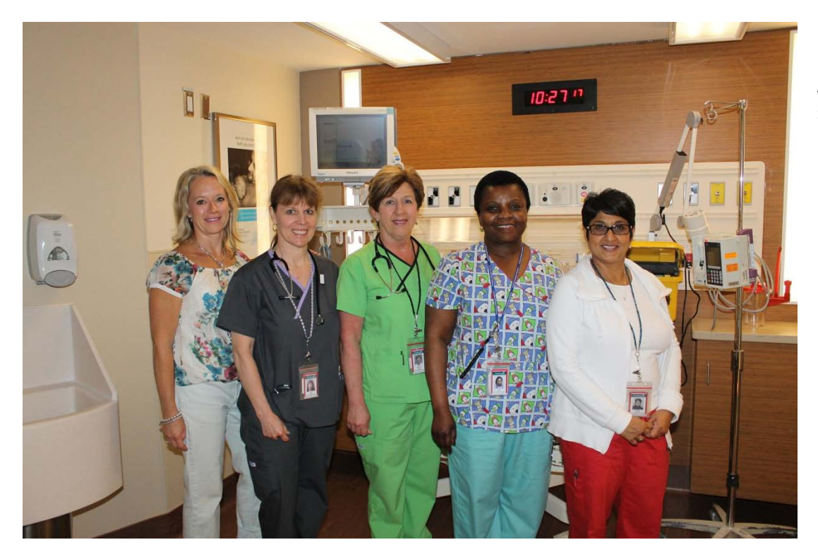
Trillium Health Partners NICU team in the new space.